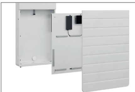
Easy assembly thanks to removable AV mounting plate