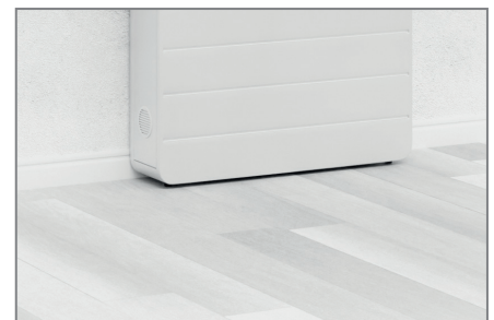
Levelling feet under the corpus provide level compensation